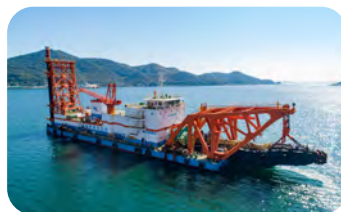
Cutter Suction Dredger ASIA MARU No.3 TOA Corporation