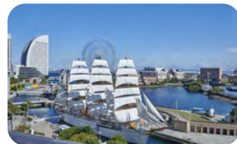
Sail Training Ship NIPPON MARU National Important Cultural Property

We aim to make Yokohama a hub of ocean-related activities by taking advantage of the numerous companies, research institutions and other marine-related entities based in the city.